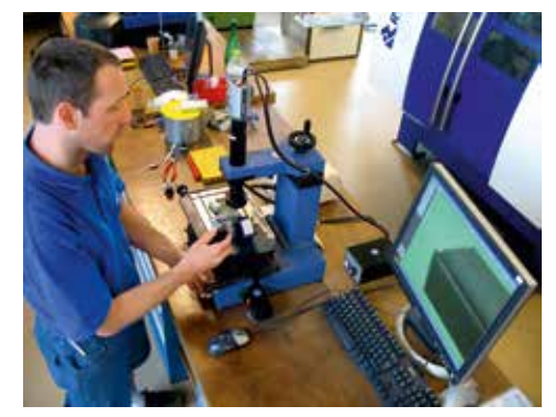
Digital Optical Systems Digital measurement and profile comparisons directly from the CAD file

We are in a position to prepare test certificates in accordance with DIN EN 10204: 2005-01.