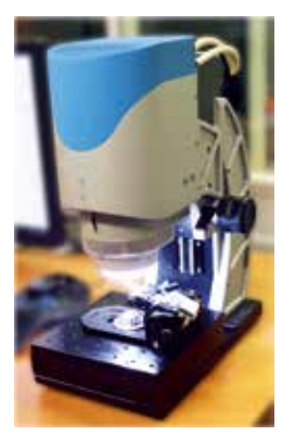
3D measuring instruments Optical measurement system optimised for 3D measurements