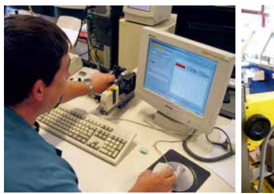
\begin{array}{c} \textbf{Diameter with the help of laser measurement} \\ \textbf{Dimensions in micrometres ($\mu m$) of milling and drilling before and after} \\ \textbf{machining} \end{array}